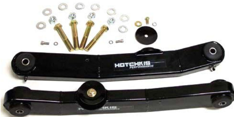
Boxed lower trailing arms to help stiffen up the rear end! Features a welded spring seat for easier spring installations!