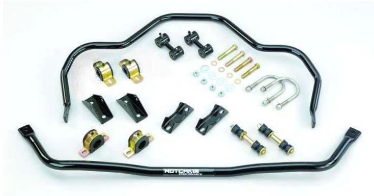
Tubular front and rear sport sway bar set!

CHECK OUT EVERYTHING ELSE HOTCHKIS PERFORMANCE MAKES FOR YOUR 65-70 B-BODY CHEVROLET!!