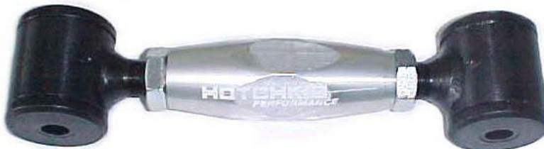
Double adjustable upper trailing arm eliminates pinion angle vibrations!

Visit Hotchkis Performance on the web at www.hotchkis.net or Call (562) 907-7757 to order!